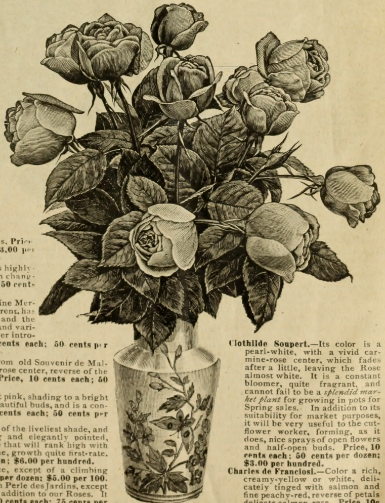
Vase of Maman Cochet Roses.

Climbing Perle des Jardins. —Identical with Perle des Jardins, except that it is a vigorous climber. A grand addition to our Roses. It will rank with the very best. Price, 10 cents each; 75 cents per dozen; $5.00 per hundred.